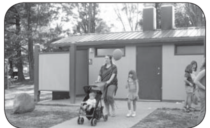
In 2006 the old restroom at Pavilions number 1 and 2 was replaced with a new unit that is engineered to evaporate 75% of the waste products into the air while removing the odor from the restroom facility.