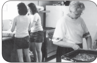
Kitchen facilities are available at Pavilion #1 and Pavilion #16.