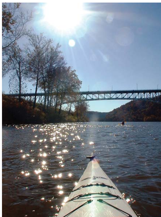
Monongahela River near Nine Mile Run, Allegheny County.

Muskies and hybrid striped bass are managed by stocking to provide the fishery. The fishery for all other species mentioned are maintained by natural reproduction in the rivers.